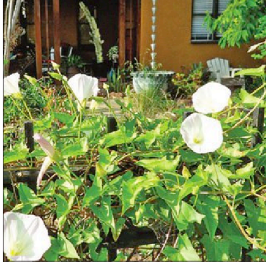
RAIN CHAIN captures water from the roof which is then channeled into a dry stream and allowed to slowly percolate into the soil.

In fact, most of the population of California lives in this soft chaparral, which most people erroneously call "a desert." The Coastal Sage Scrub plant community exists along the coast of California, roughly from San Francisco down to San Diego. These plants are perfectly suited to the hot, dry summers and cool wet winters that define the Mediterranean climate we live in. In the summertime, they conserve energy and water by resting, or